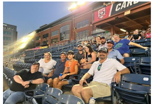
PCEA Triangle Social at Durham Bulls

In July, we replaced the normal Chapter Meeting with a Durham Bulls outing. It was very hot night, but we had a great night watching the Durham Bulls beat the Charlotte Knights 12-2.