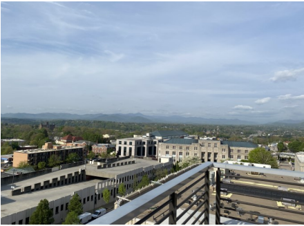
View from the Hospitality Suite

The convention started with a morning National Board Meeting on Thursday April 29th (after a long night in the Hospitality Suite). Followed by a perfectly sunny day for a large group to play golf at the Grove Park Inn or Day at the Spa. Thursday evening was the Kick-off Party at the Grove Park Country Club.