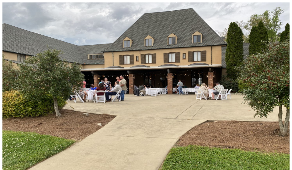
Kick-Off Party at the Grove Park Country Club